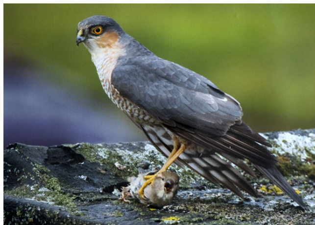
Sparrowhawk – a pair nested in Coleorton Wood this season.