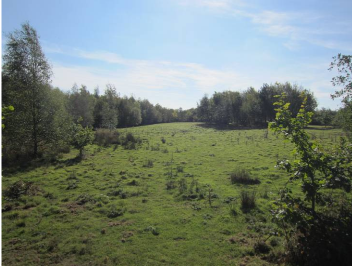
Open grassland at the top of the Pit Bank

The re-survey of the site is now complete and a revised habitat plan has been drawn up. The next stage is to generate a five year management plan for the site. This plan needs to be agreed by LCC.